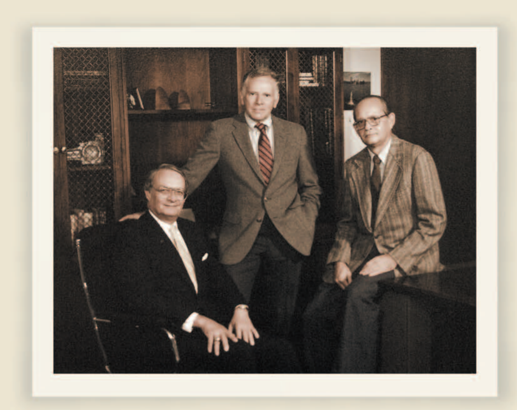
A Brief History Of Ariel Compressors